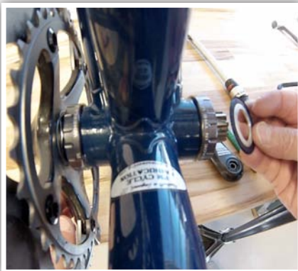
8. Make sure outer dust seal is in place before installing left crank arm.