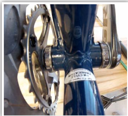
10. Add spacers as necessary to take up any play, remove spacers as necessary if binding occurs.

NOTE: Due to the wide variety of frame manufacturers, Wheels Manufacturing cannot guarantee compatibility with all frames. Please consult with your specific frame manufacturer before installation. Wheels Manufacturing is not responsible for damage done to your frame as a result of installation or use of this product.