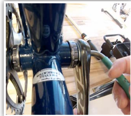
9. Install left crank arm, tighten crank to manufacturer specifications, approximately 48-54 Nm.