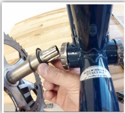
7. Install right crank arm, making sure wave washer and outer dust seal is installed.